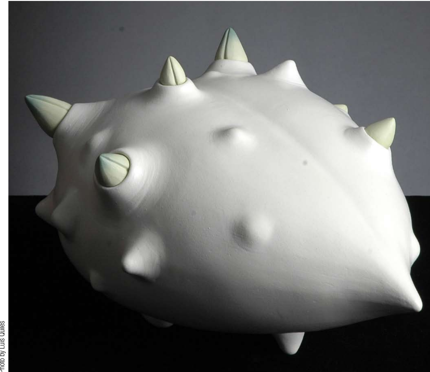
Pod Trio, 2005