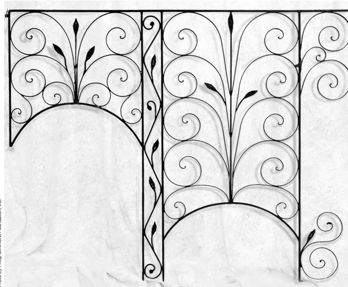
Room Divider, c. 1970