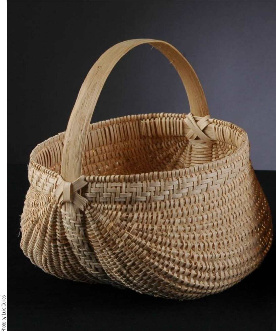
White Oak Basket, 2004