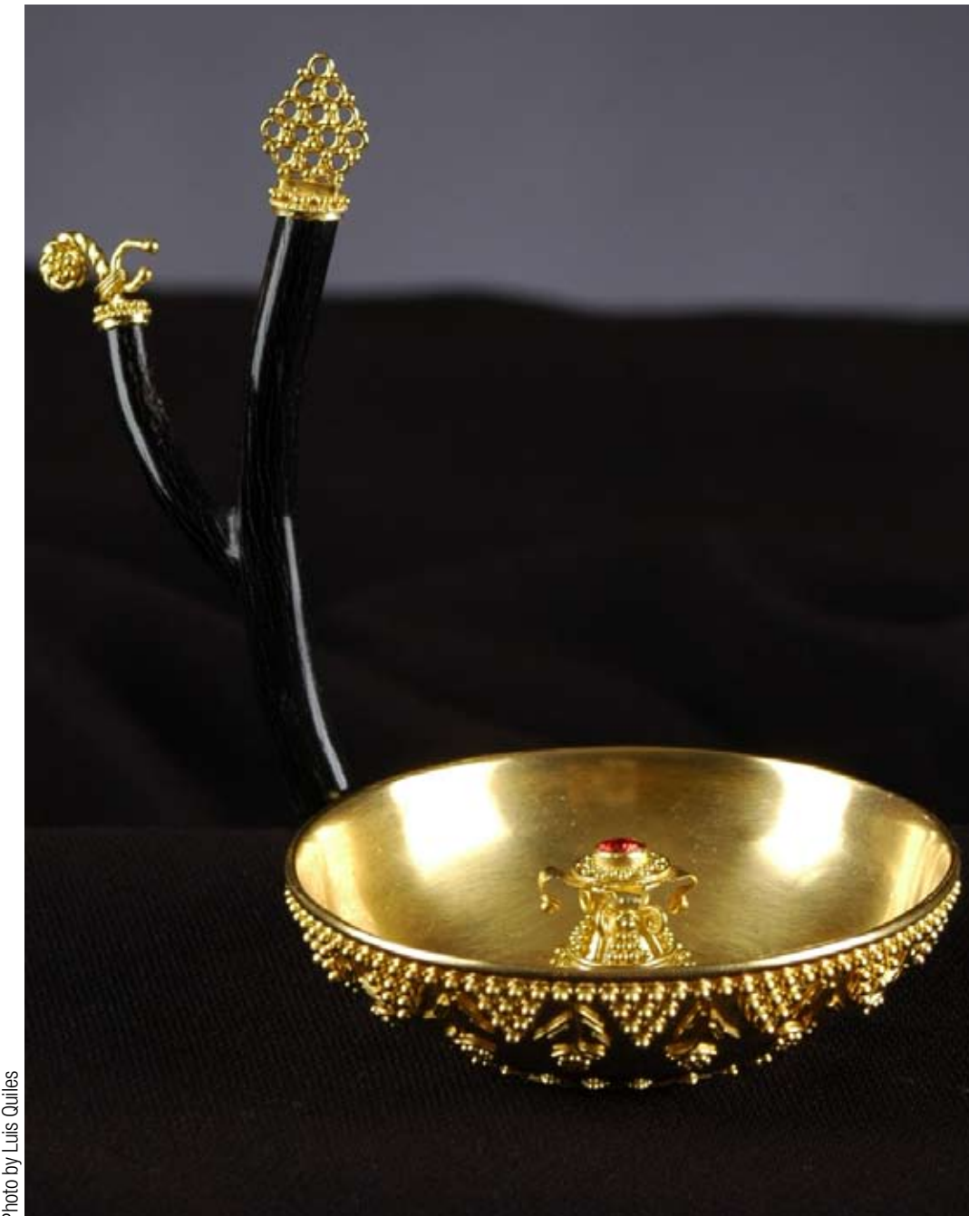
Full Measure Cup, 2006