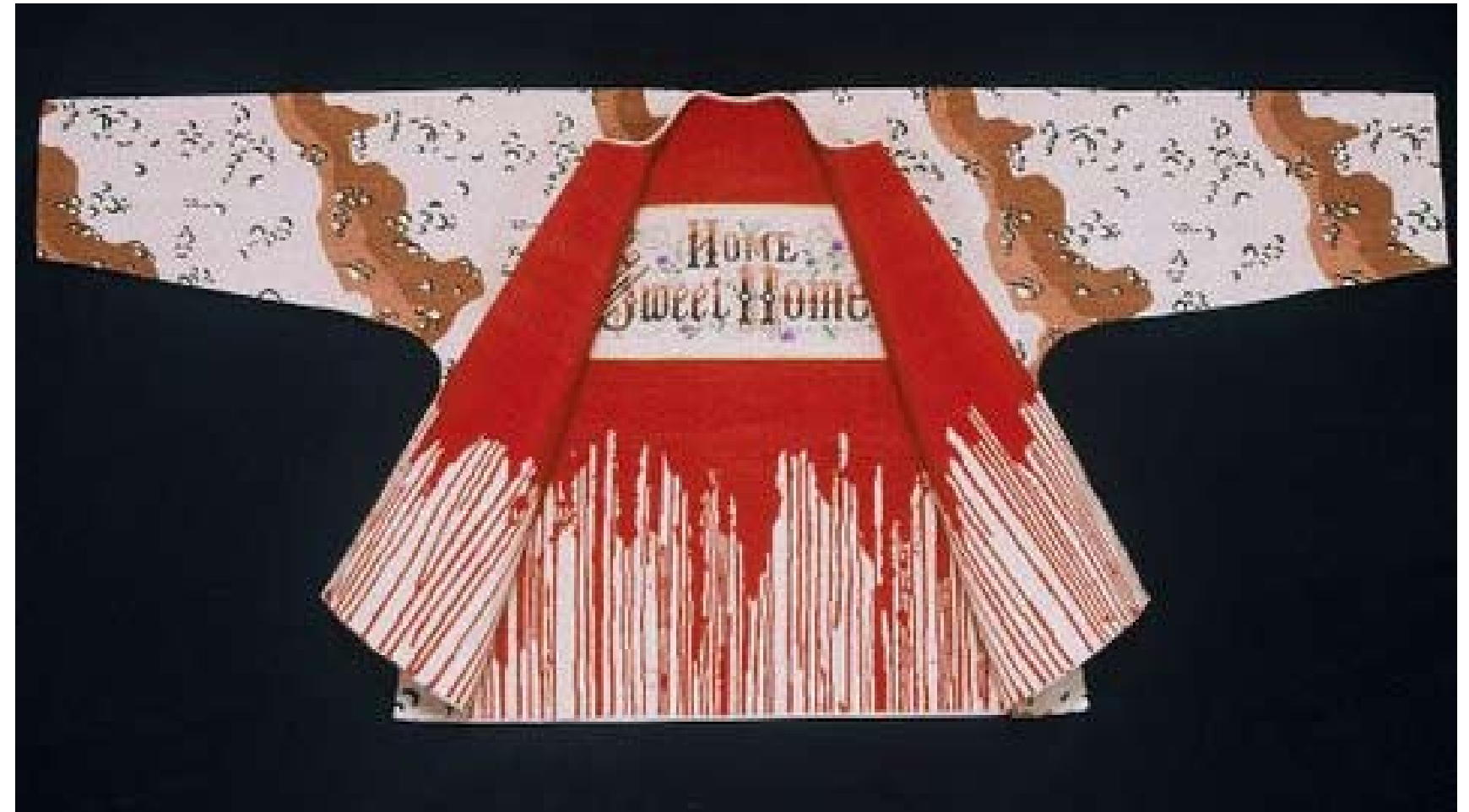
Freedom's Price, 2005

Is the artist commenting on the violence that is so common within our American “home” culture?