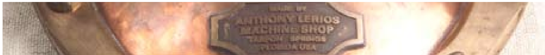
Sponge Diving Helmet, 1986