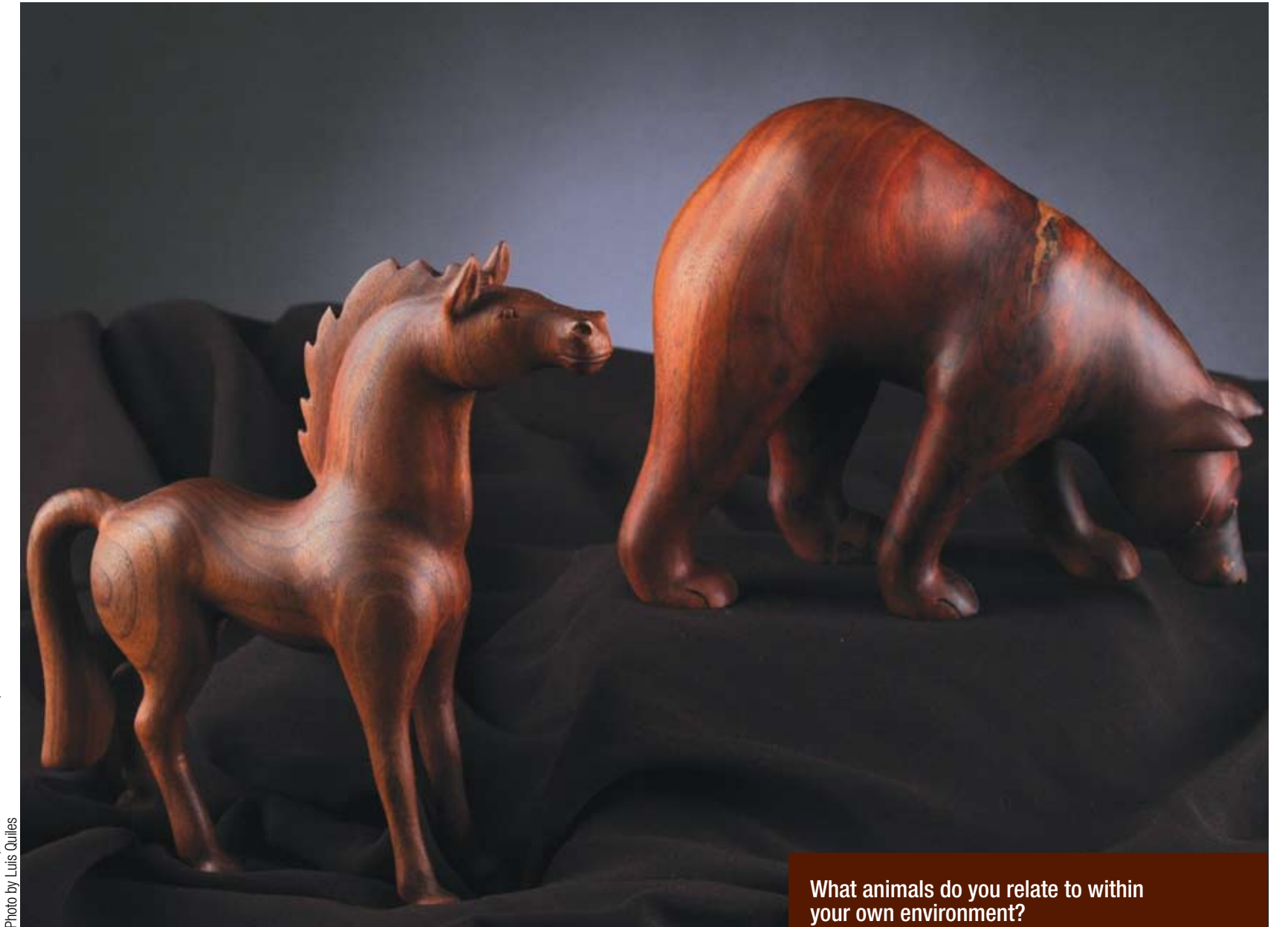
Carved Bear, 2000 and Carved Horse, 1992